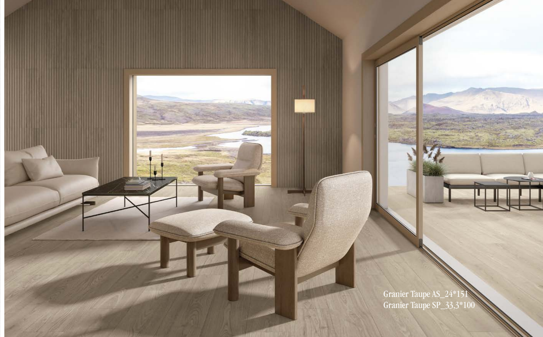
Granier Taupe AS_24*151 Granier Taupe SP_33,3*100