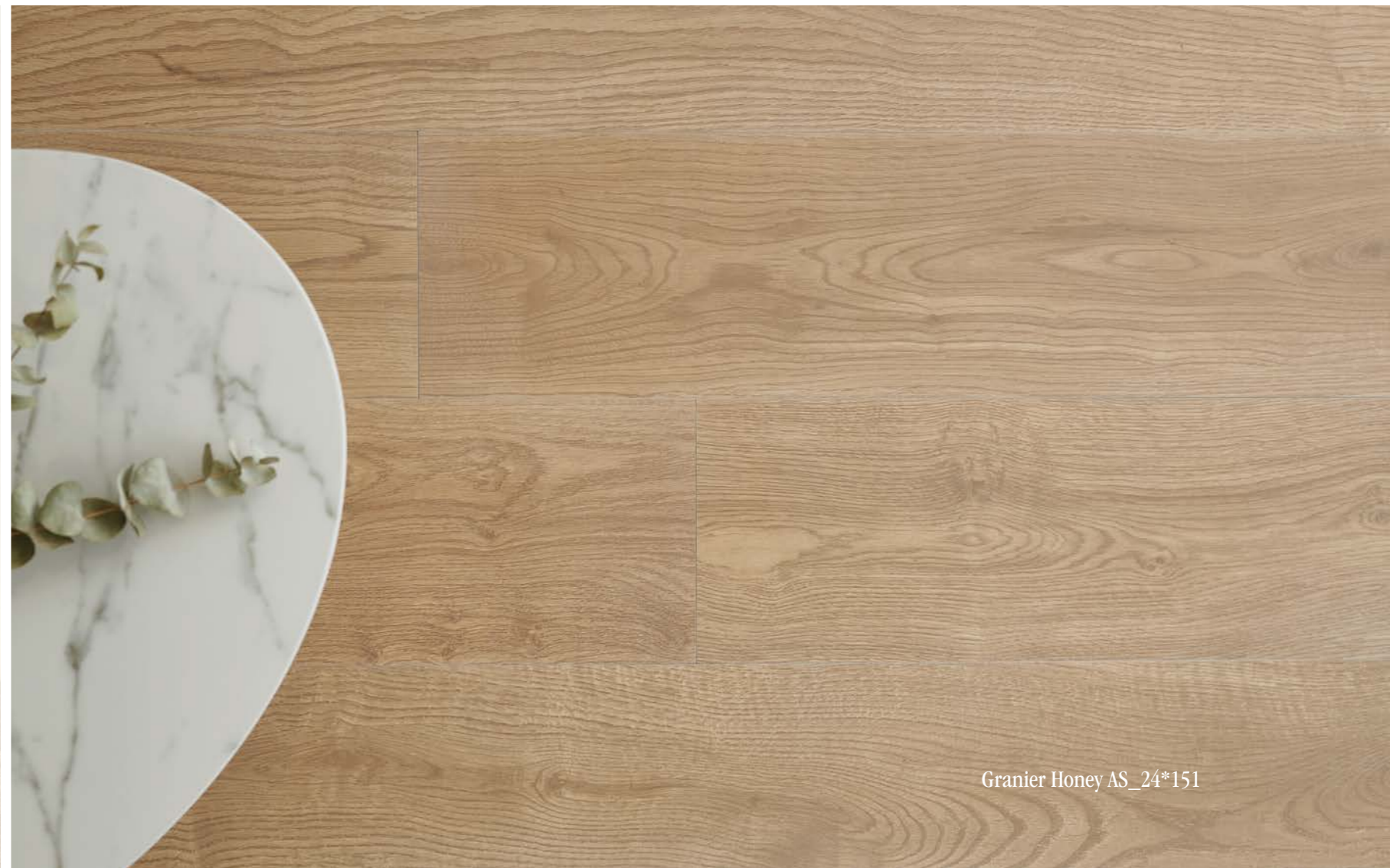
Granier Honey AS_24*151