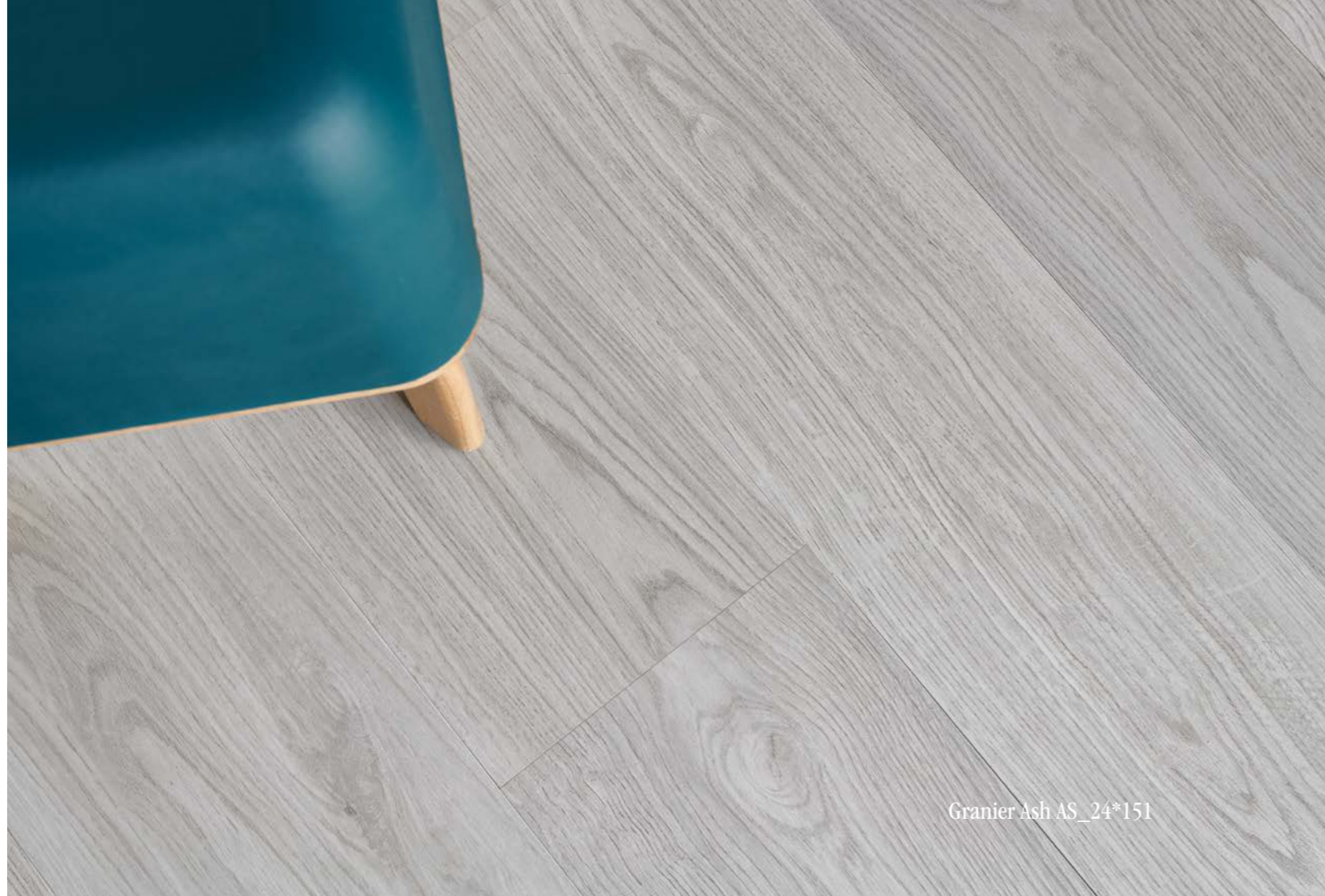
Granier Ash AS_24*151