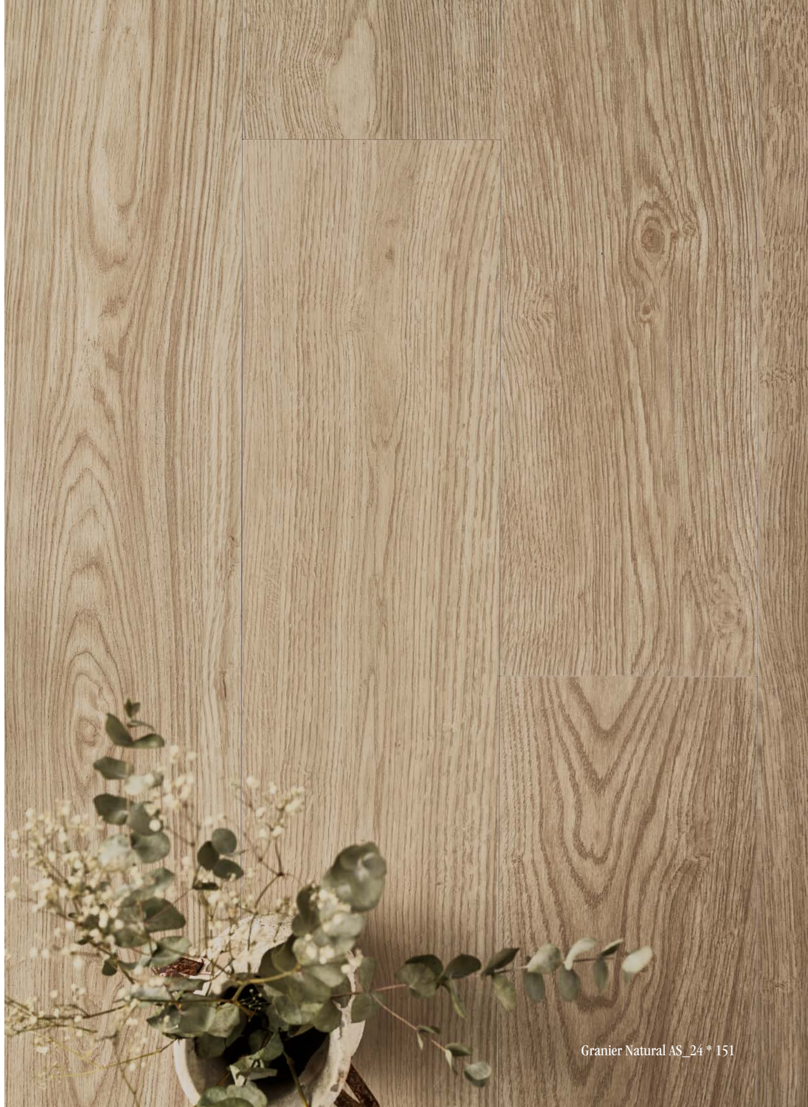
Granier Natural AS_24 * 151